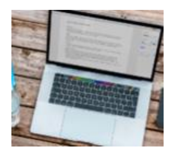
Support the Development of Digital Literacy

The use of the PLD for teaching and learning aims to: