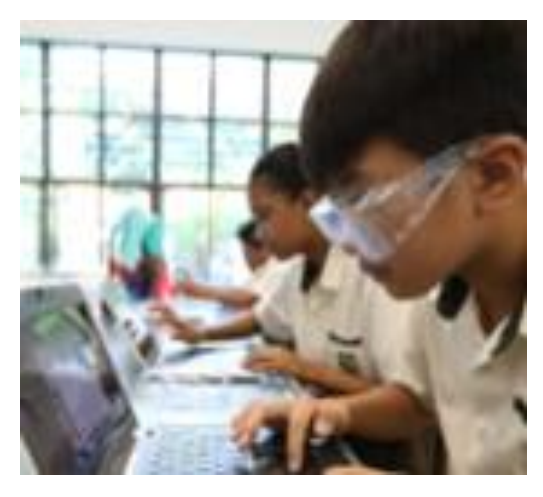
Support Self-Directed and Collaborative Learning