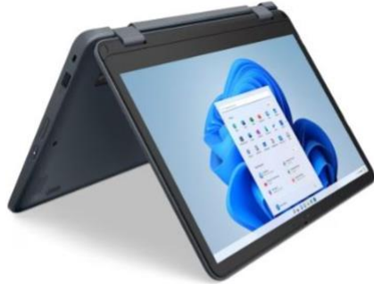
Lenovo 300w Yoga Gen 4